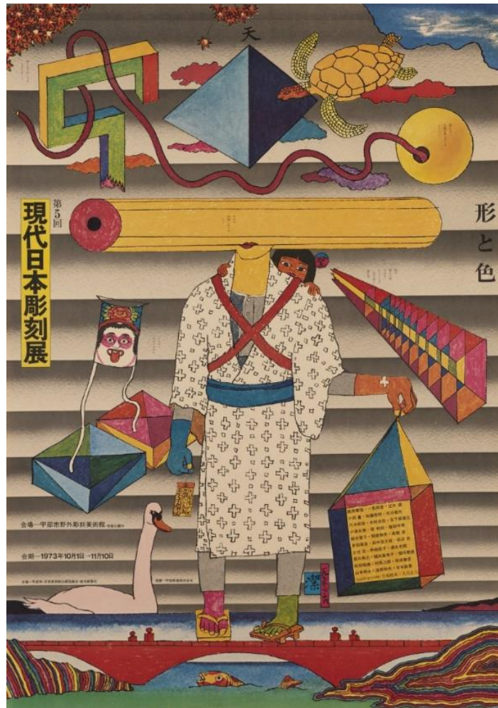
'The 5th Exhibition of Contemporary Japanese Sculpture' (1973), lithograph, 40 1/2 x 28 3/4 in.